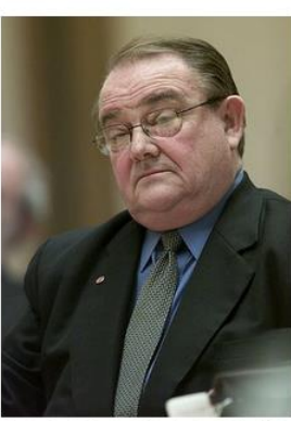
Senator Alan Eggleston.

"It was very much in CBA's interests to impair otherwise viable loans," Senator Eggleston told the Senate late on Tuesday night. "The implications of this conduct are profoundly serious, and it has been suggested the matter can only be resolved by establishing a public inquiry to establish the facts as to whether or