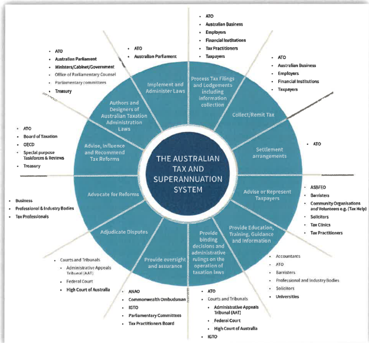
Figure 1 – Overview of the Administration of the Tax and Superannuation System

To illustrate, Figure 1 below sets out a range of processes, functions and oversight within the administration of Australian tax and superannuation system and identifies the key stakeholders and participants in relation to each of these functions.